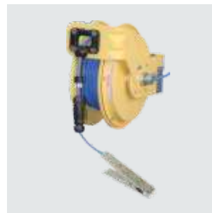
VESM02 Retractable Cable Reel Product Code: VESM02