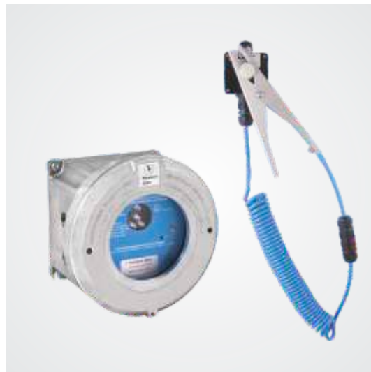
Earth-Rite RTR Road Tanker Grounding System

The Earth-Rite RTR utilises patented electronics called “Tri-Mode” technology (next page) to establish three key inputs that must be in place before the loading/unloading operation can commence. When the three key inputs are met, only then will the Earth-Rite RTR go permissive and energise its pair of volt-free change-over contacts to engage the pump, or whatever equipment is interlocked with the system, to control the flow of product to or from the road tanker. Any static generated by the loading operation is transferred from the road tanker via the Earth-Rite RTR to ground, eliminating static electricity as a potential source of ignition.