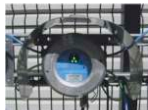
Sun Shield Product Code: ER2/SH

The Sun Shield casts a shadow over the indicators during peak sun light hours so that operators can easily view the ground status indicators. The shield is constructed from stainless steel and can be fitted to any installation in a matter of minutes.