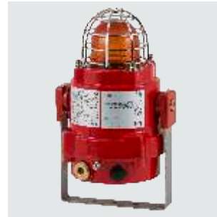
Ex Strobe Light Product Code: STROBE11/A (Amber strobe). Please enquire for options