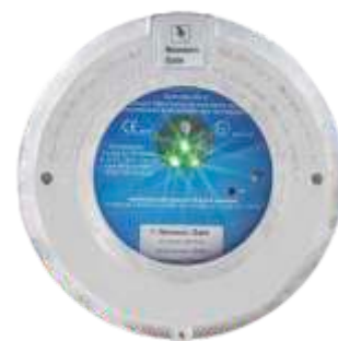
Pulsing LEDs confirm positive ground condition